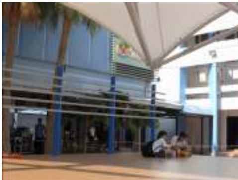
Youths hanging out at the stage area