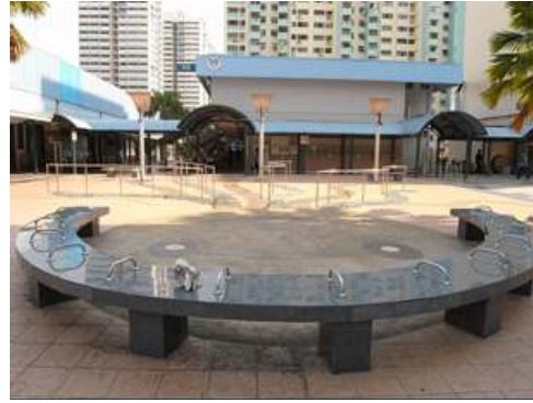
Bike racks & Foot reflexology path, railings and seating after upgrading