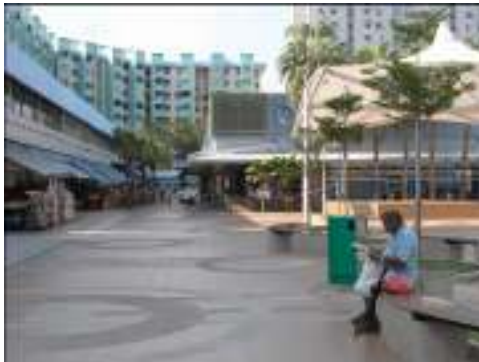
Elderly folk resting at the Plaza area