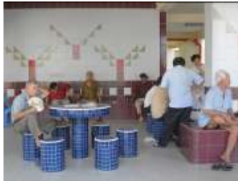
Elderly men resting at chess area facing Plaza