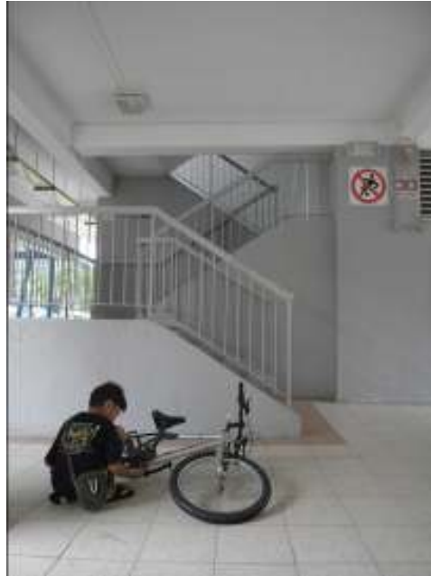
Staircase near Lift Landing